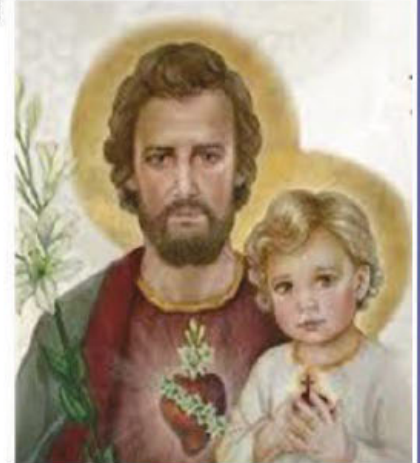
ST. JOSEPH PRAY FOR OUR FATHERS.

A suggested offering of $10 per name will be greatly appreciated.