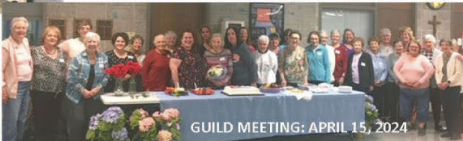
GUILD MEETING: APRIL 15, 2024