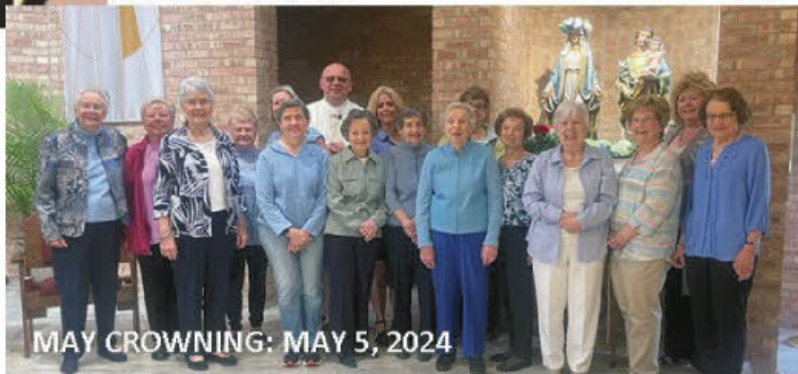
MAY CROWNING: MAY 5, 2024